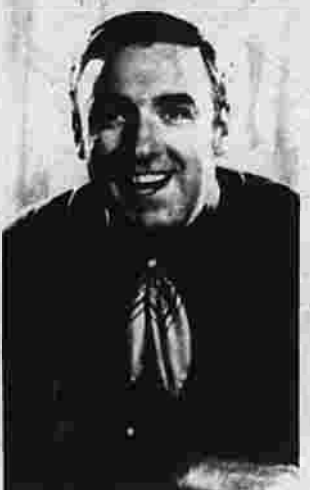
Jim Nabors stars in "The Jim Nabors Hour," which premieres Thursday 8-9 p.m. on CBS.