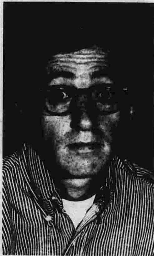
Woody Allen brings his special humor to "The Woody Allen Special" Sunday from 9 to 10 p.m. on CBS.