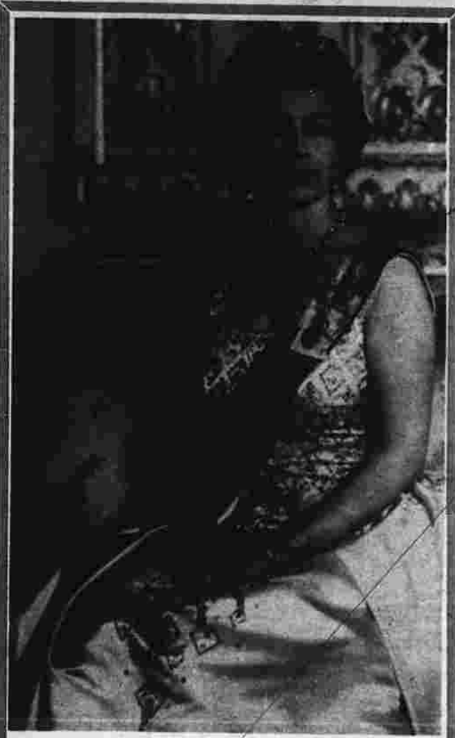
Queen Elizabeth during a scene from "Royal Family," a view of the British monarchy on and off duty. It will be televised Sunday 7:30-9 p.m. on CBS.