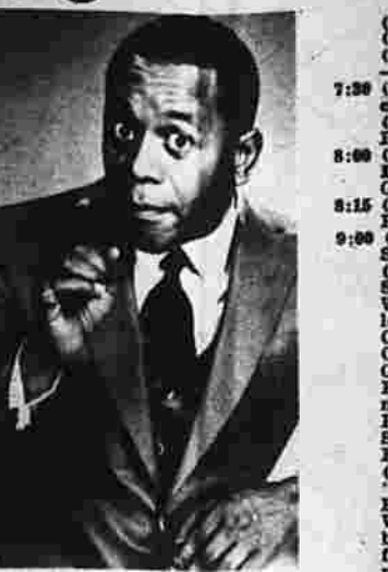
Flip Wilson stars in his own special program Monday 10-11 p.m. on NBC.