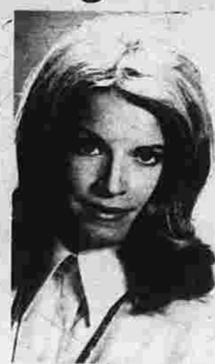
Julie Sommars in CBS' "The Governor and J.J.," starting Thursday 9:30-10 p.m.