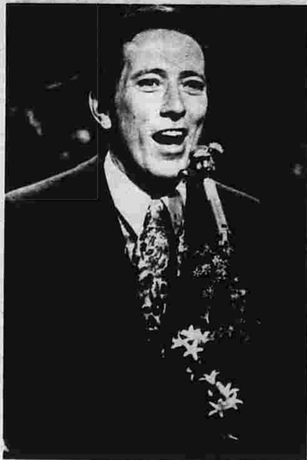
With a flowered mike, Andy Williams returns for a new season today from 7:30 to 8:30 p.m. on NBC.