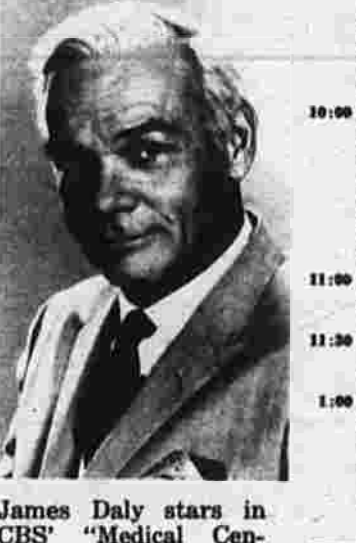
James Daly stars in CBS' "Medical Center," which has its premiere Wednesday 9-10 p.m.