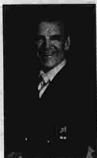
Fred Astaire stars in ABC's "It Takes a Thief," premiering Thursday 10-11 p.m.