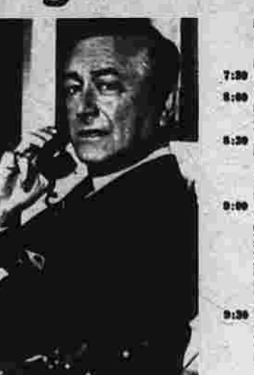
Robert Young is the star of ABC's "Marcus Welby, M.D.," premiering Tuesday 10-11 p.m. on ABC.