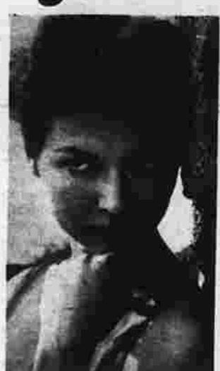
Gia Scala in the film "The Guns of Navarone" Thursday and Friday at 9 p.m. on CBS.